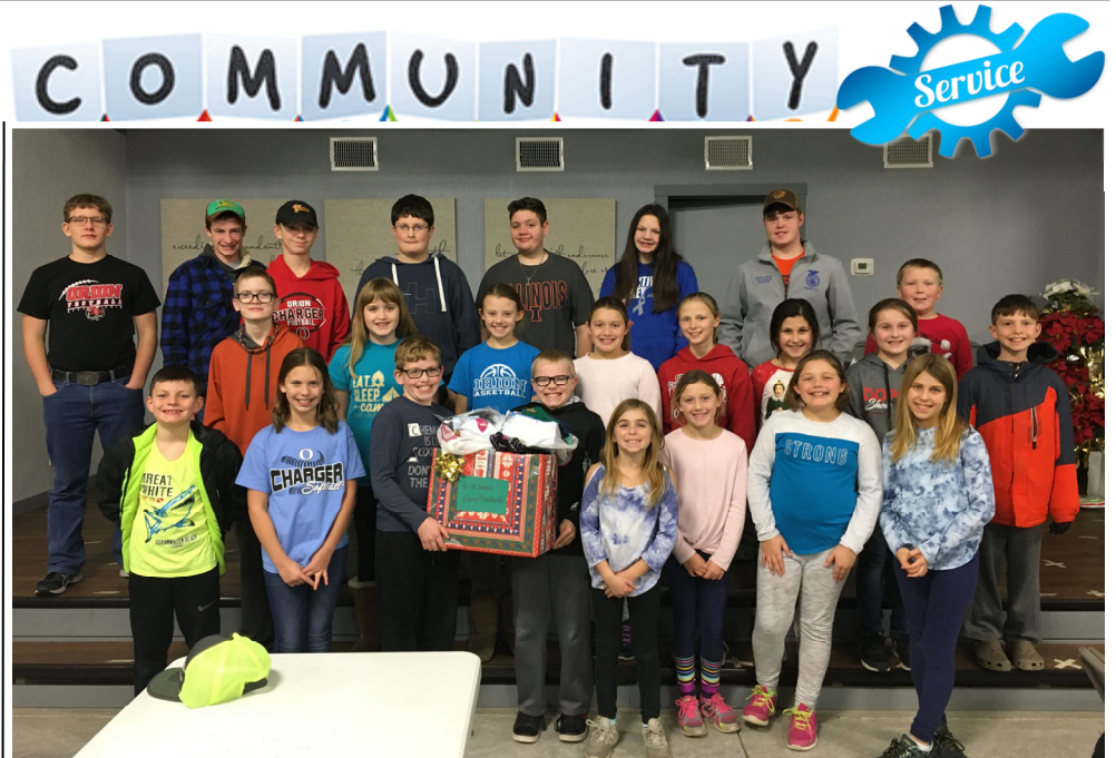
The Western Jr Farmers 4-H Club members collected and donated mittens, hats, gloves and other winter supplies to CR Hanna Elementary as part of their December Service Project.